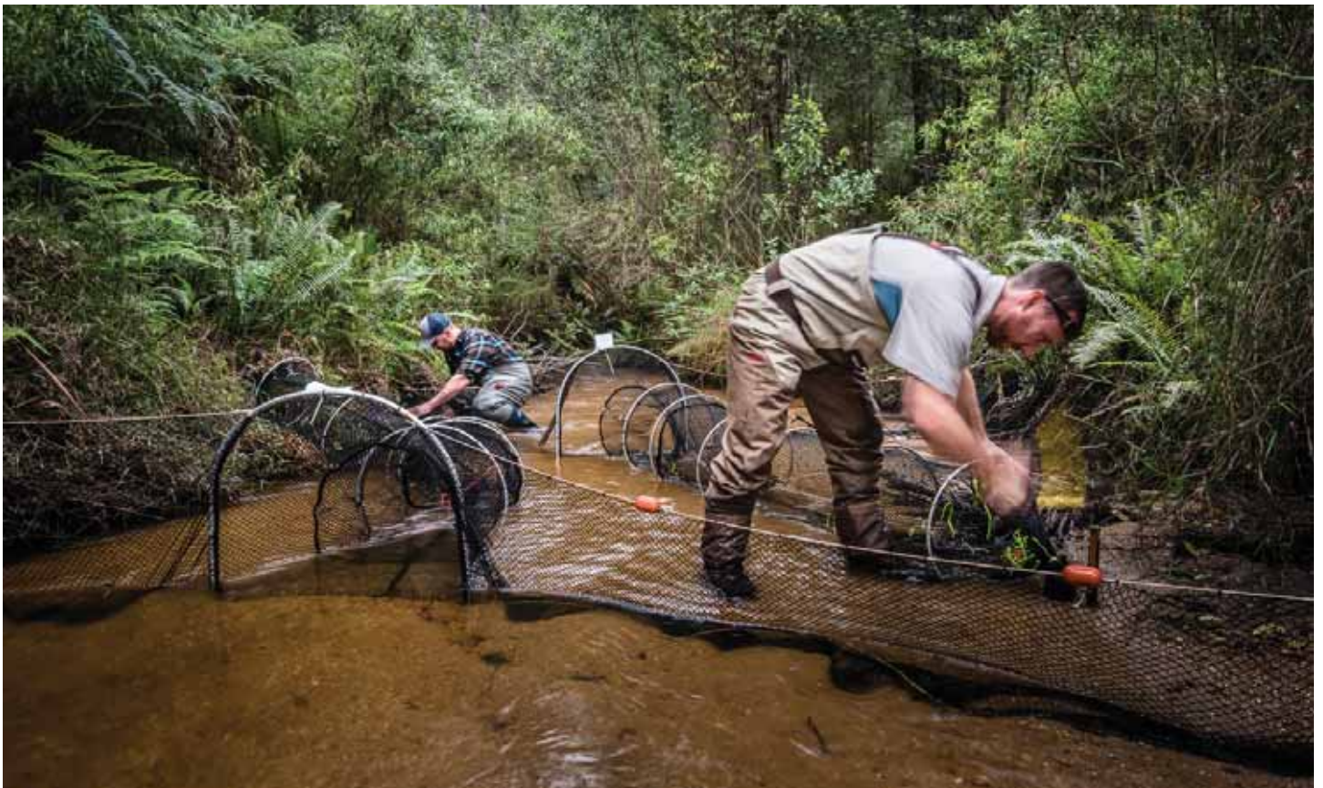
Setting up to capture. As part of Melbourne Water’s monitoring program, researchers set up fyke nets in the afternoon to try to capture the elusive platypus. These are checked every three to four hours.

“For example, a newspaper report in the Kerang New Times dated August 1908 noted that 22 platypuses were caught in the Yarra River near Melbourne’s Princess Bridge. However, I’m not sure that any have been seen in that part of the river for a very long time.”