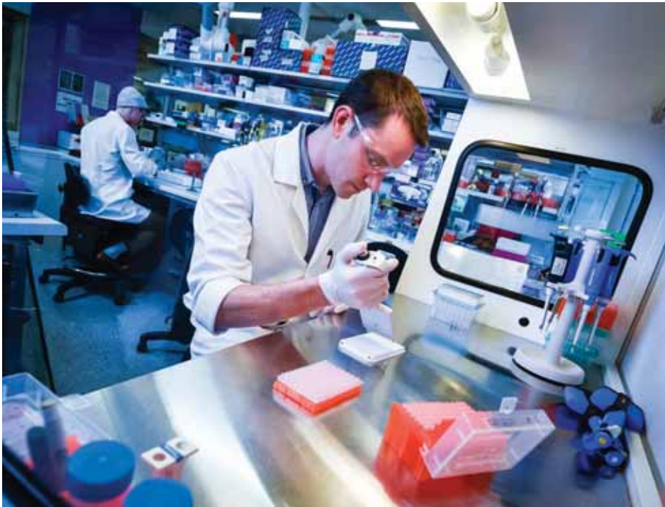
Testing for platypus DNA. DNA from a river water sample is extracted in the laboratory so it can be analysed to look for any platypus DNA that may have been washed downstream.