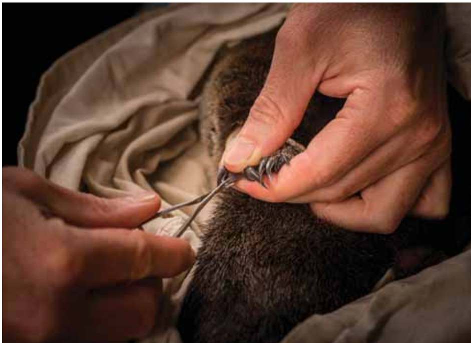
Skin sample collection for genetic testing. A small sample of skin between the toes is taken to look at population genetic health, to understand genetic diversity, population viability and familial relationships.