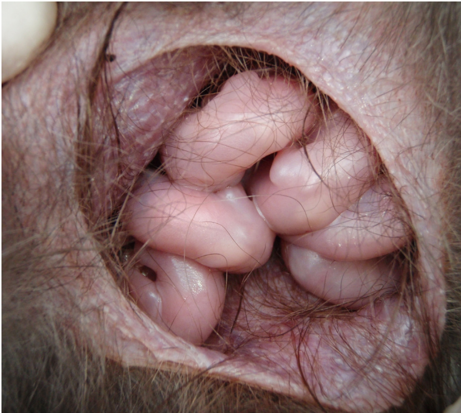
Reproduction success still appears high, with nearly all quolls carrying a full compliment of six pouch young.

high quoll numbers. But to my surprise, there was actually no relationship between cat and quoll abundance.