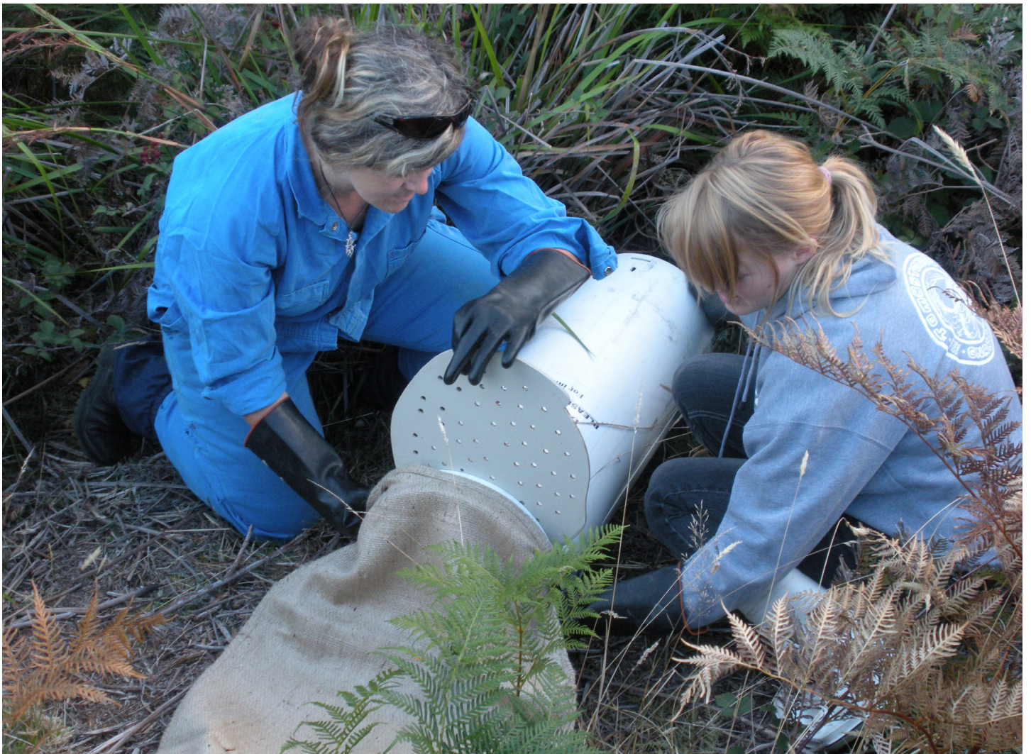
Quolls were trapped using PVC devil traps.

However, the species activity profiles revealed more interesting results. Quolls were strictly nocturnal, with activity peaking in the first couple of hours after sunset each night, regardless of season. But cats changed their activity times quite dramatically between seasons. In winter, cats were mostly active during the afternoon, concentrating their activity in the hours just before sunset. But in summer, cats were more active at night, increasing the chance that a quoll will run into a cat. Unfortunately, summer is the time of year when juvenile quolls first emerge from their natal dens as independent little fluff balls. With cats being most active at this time, the predation risk is much higher for these small, naïve juvenile quolls. Indeed, trapping results revealed that very few juveniles entered the population in areas where quolls had declined, whereas sites with stable populations had a surge in juveniles over summer.