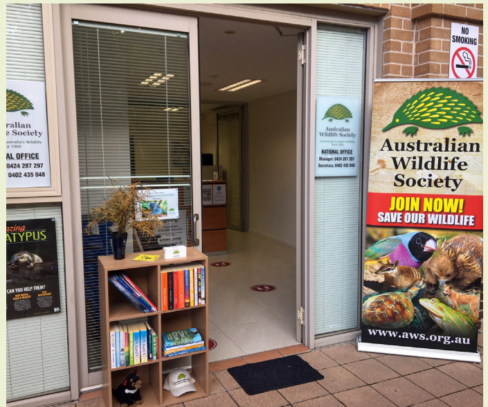
New National Office shopfront at Hurstville in New South Wales.

We encourage everyone interested in wildlife conservation to join the Society to help save Australia's unique and precious native flora and fauna.