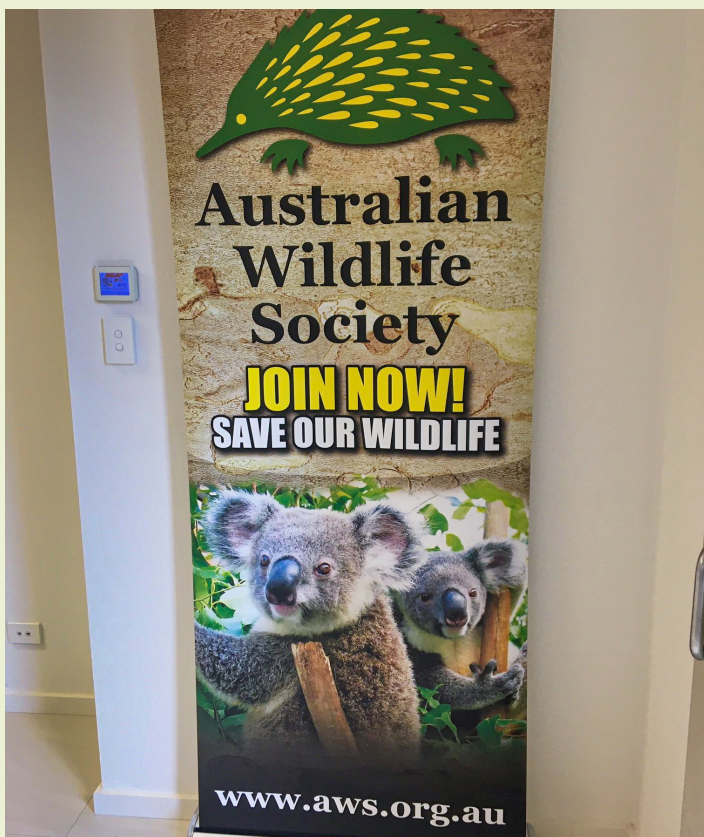
Australian Wildlife Society banner.