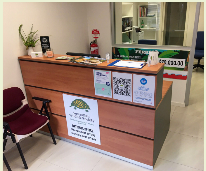
National Office reception area.