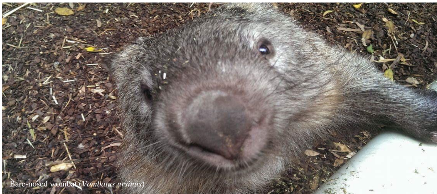
Bare-nosed wombat ( Vombatus ursinus )