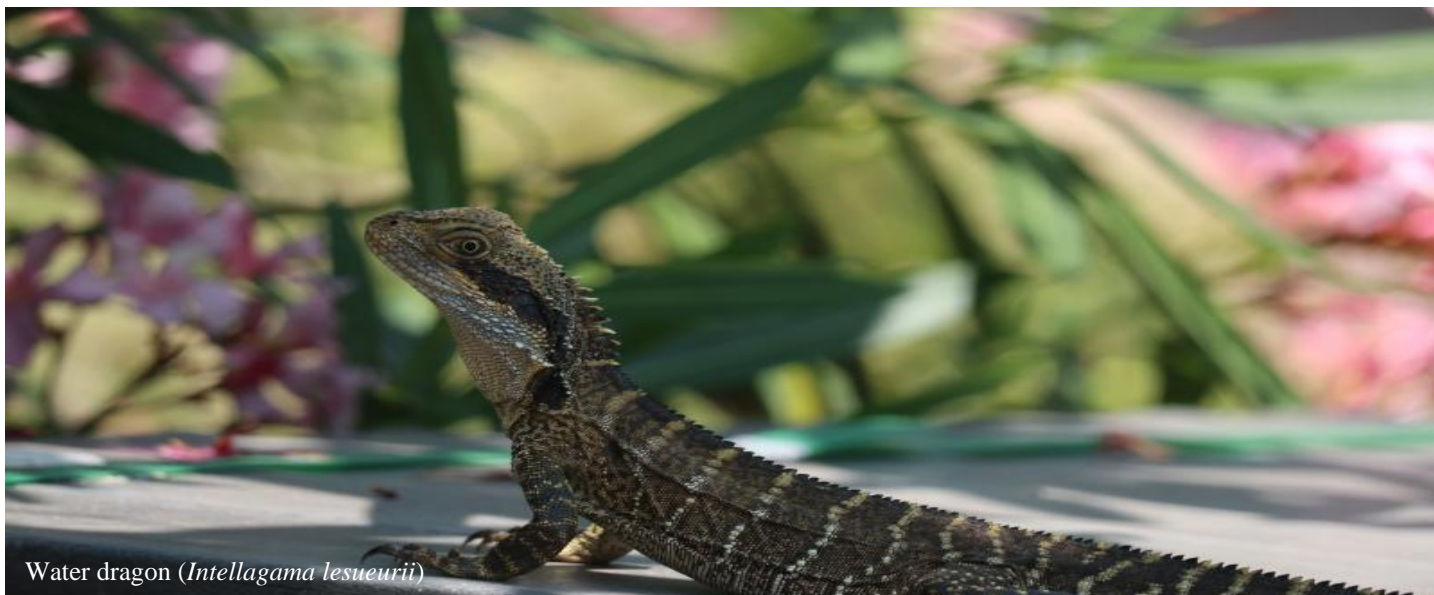
Water dragon ( Intellagama lesueurii )