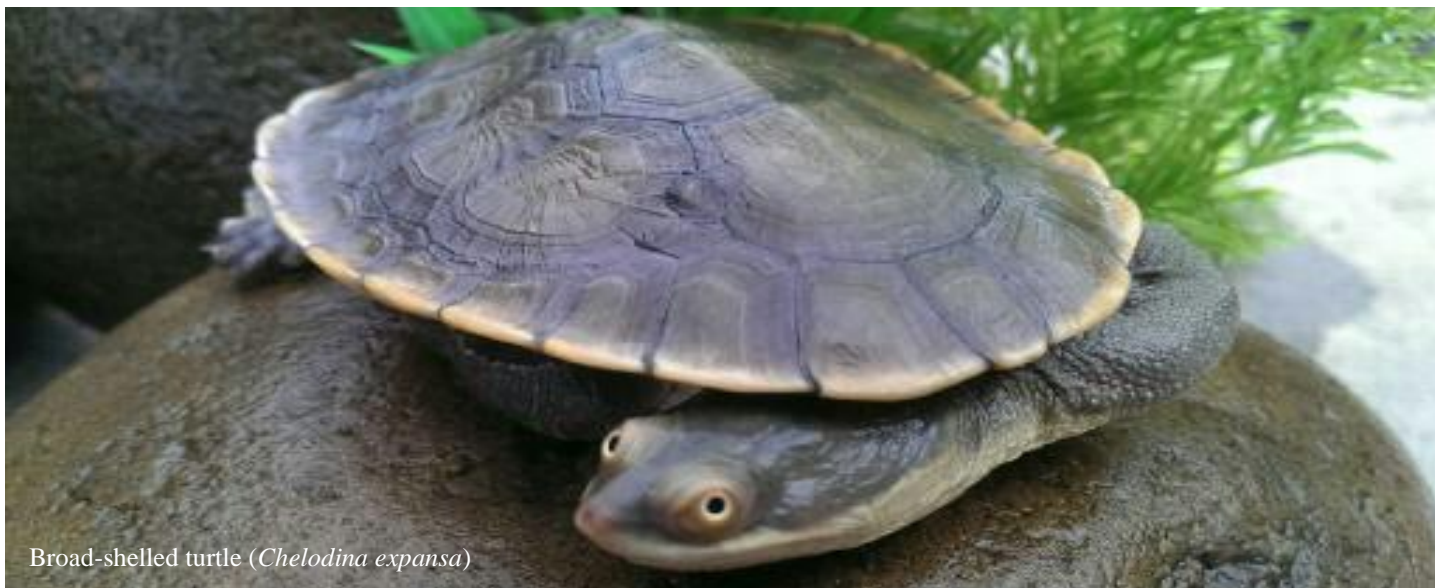
Broad-shelled turtle ( Chelodina expansa )