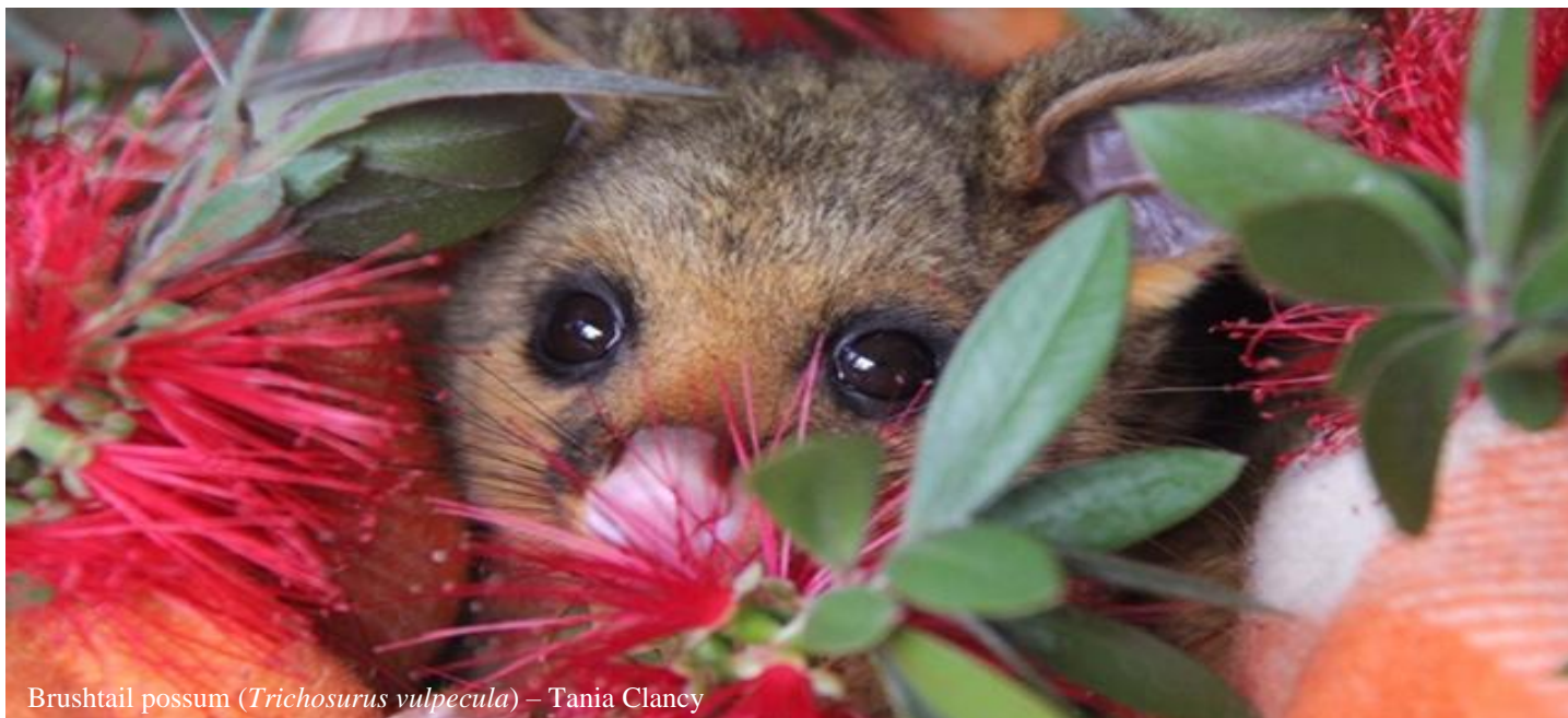
Brushtail possum ( Trichosurus vulpecula ) – Tania Clancy