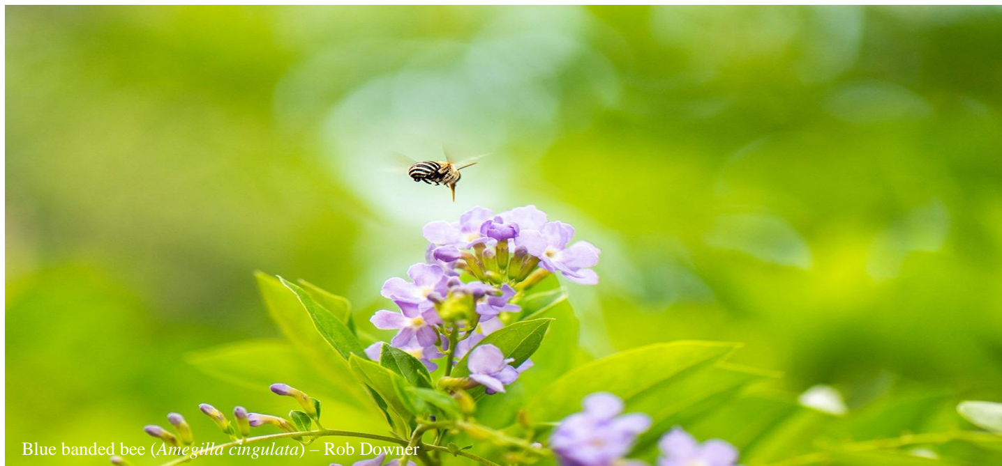
Blue banded bee ( Amegilla cingulata ) – Rob Downer