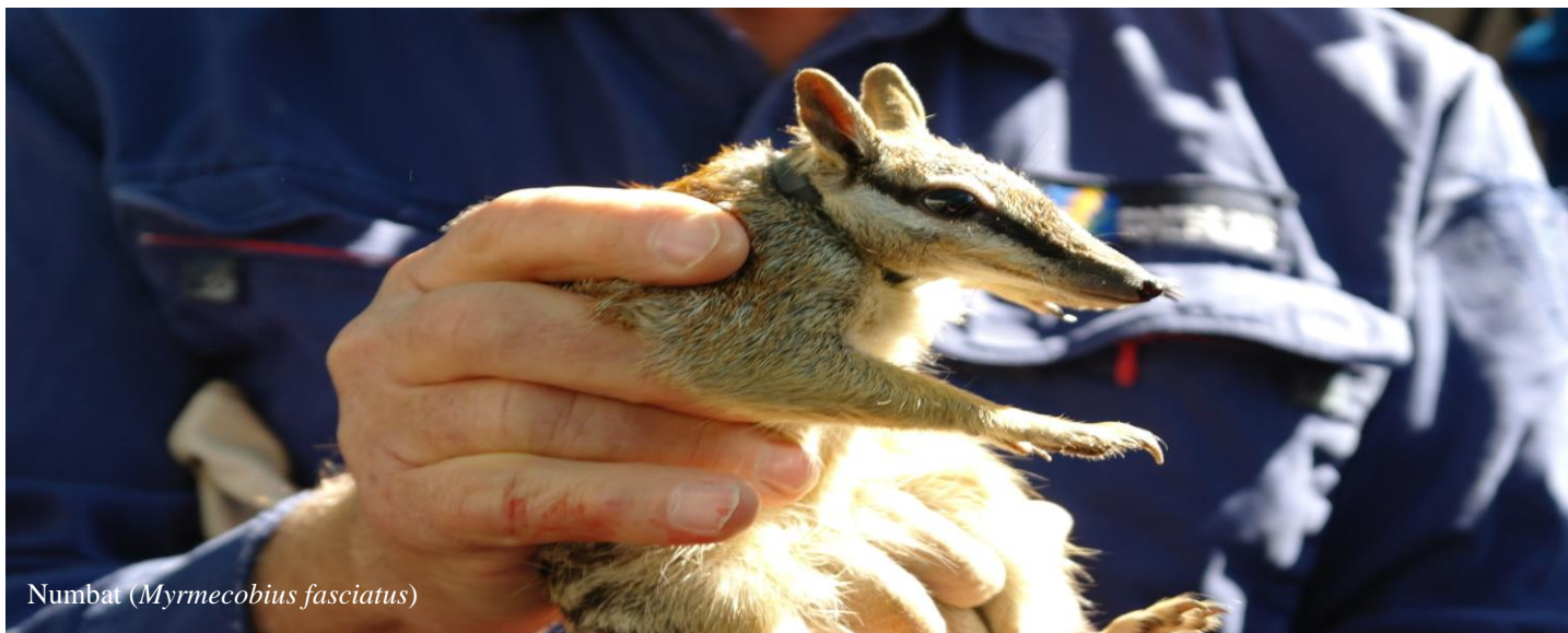
Numbat ( Myrmecobius fasciatus )