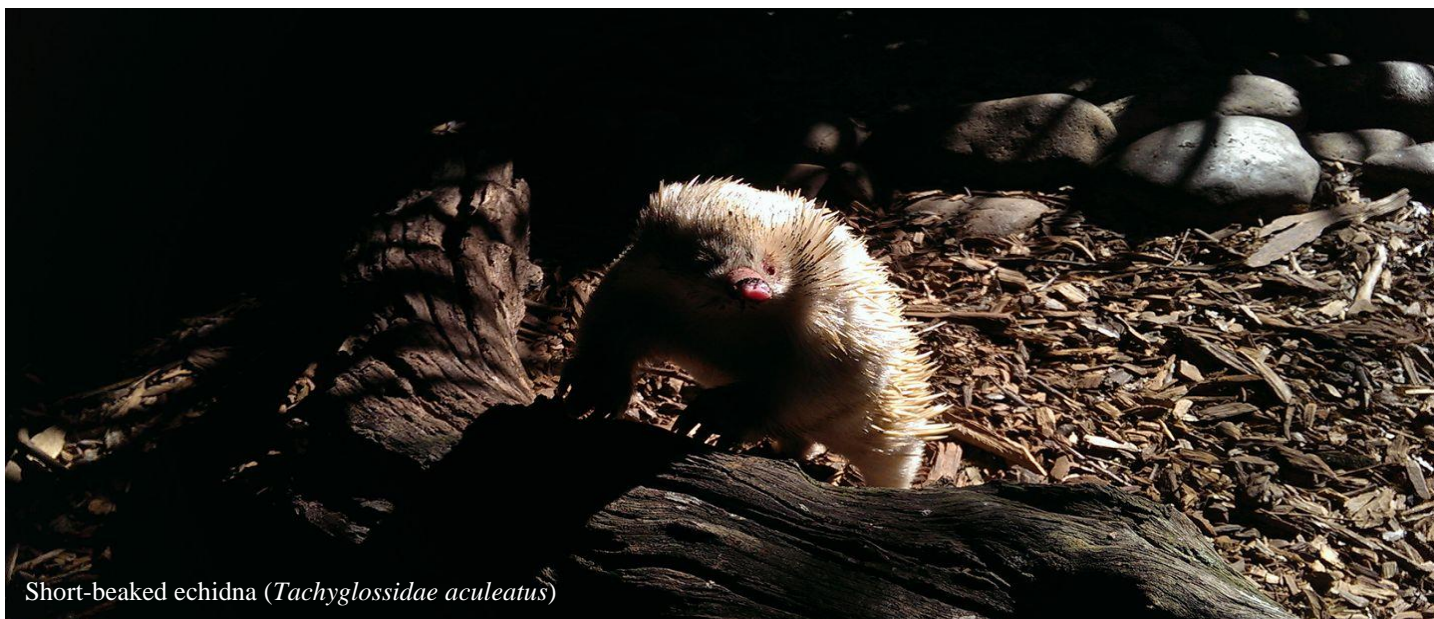
Short-beaked echidna ( Tachyglossidae aculeatus )