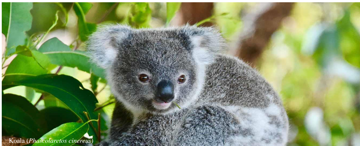
Koala ( Phascolarctos cinereus )