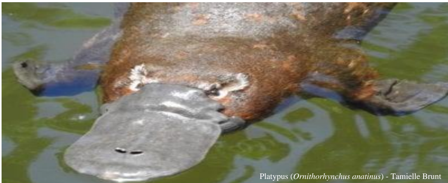
Platypus ( Ornithorhynchus anatinus ) - Tamielle Brunt