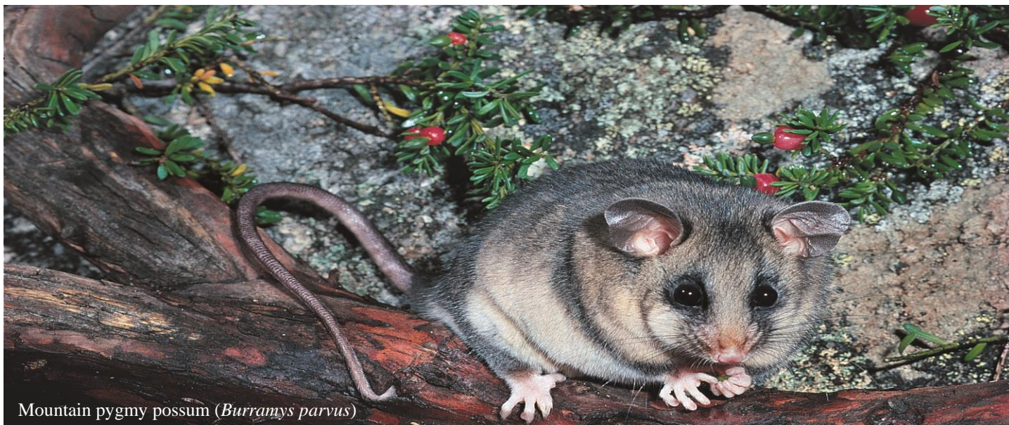
Mountain pygmy possum ( Burramys parvus )