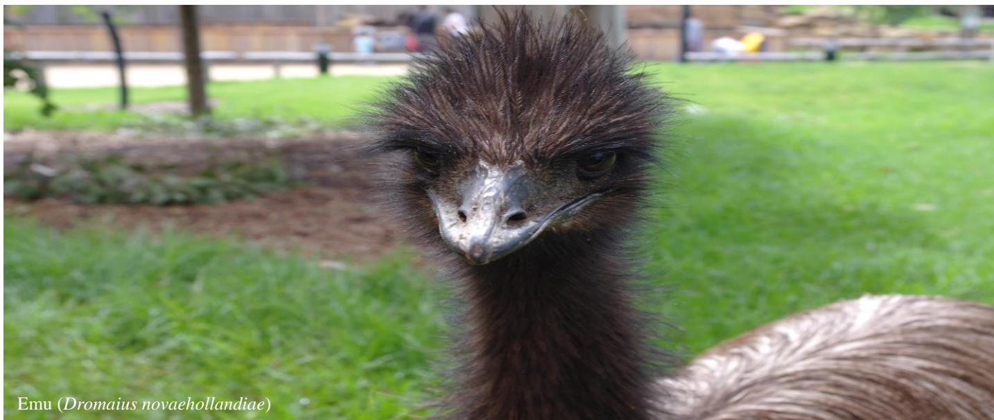
Emu ( Dromaius novaehollandiae )