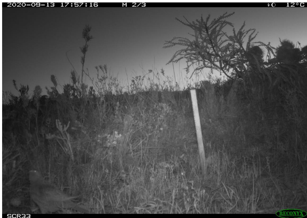
The elusive western ground parrot captured on motion sensing cameras deployed in conjunction with Solar ARUs

Since the last newsletter the Fitzgerald River National Park solar ARUs purchased by the Friends of the WGP have also been serviced and the autumn – winter monitoring units collected. Thanks to the Friends and their fundraising, this was done very efficiently in a day. There is now a large backlog of data to process, which will be started in the coming months.