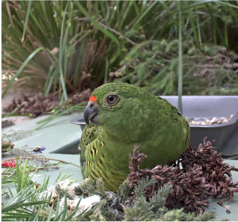
Male Zephyr