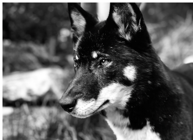
Dingo ( Canis lupus dingo ).