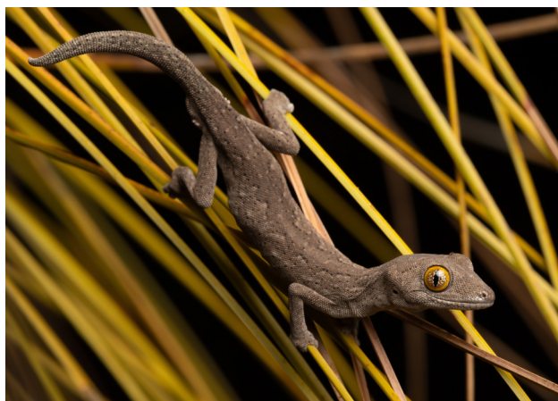
Golden-eyed gecko ( Strophurus trux ).

The annual judge's prize of $1,000 was won by Wes Read for his photo of a golden-eyed gecko ( Strophurus trux ) which was only recently described in 2015 and is not yet classified. The annual people's choice prize of $500 was won by Tiffany Naylor for her photo of a dingo ( Canis lupus dingo ), an apex predator contributing to the control of many feral species that threaten Australia's wildlife and plays a very important role within the environment, keeping natural systems in balance.