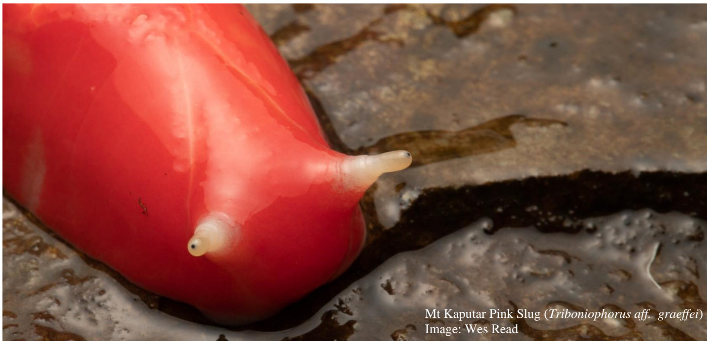
Mt Kaputar Pink Slug ( Triboniophorus aff. graeffei )