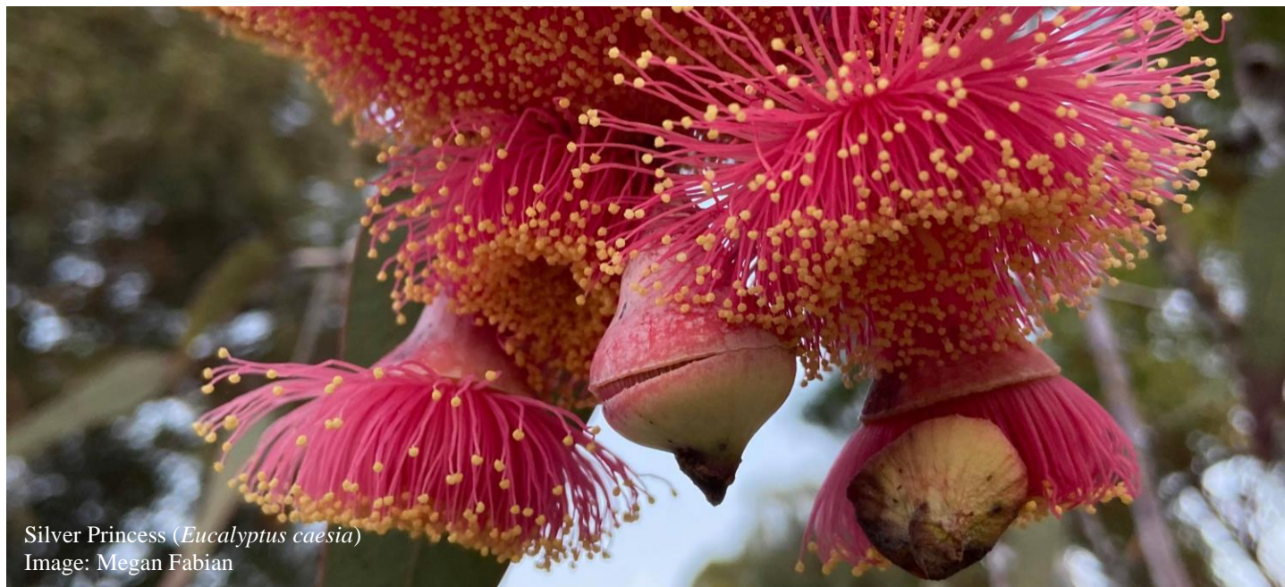
Silver Princess ( Eucalyptus caesia )