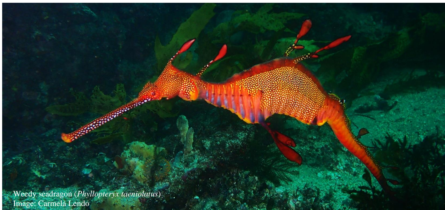
Weedy seadragon ( Phyllopteryx taeniolatus )