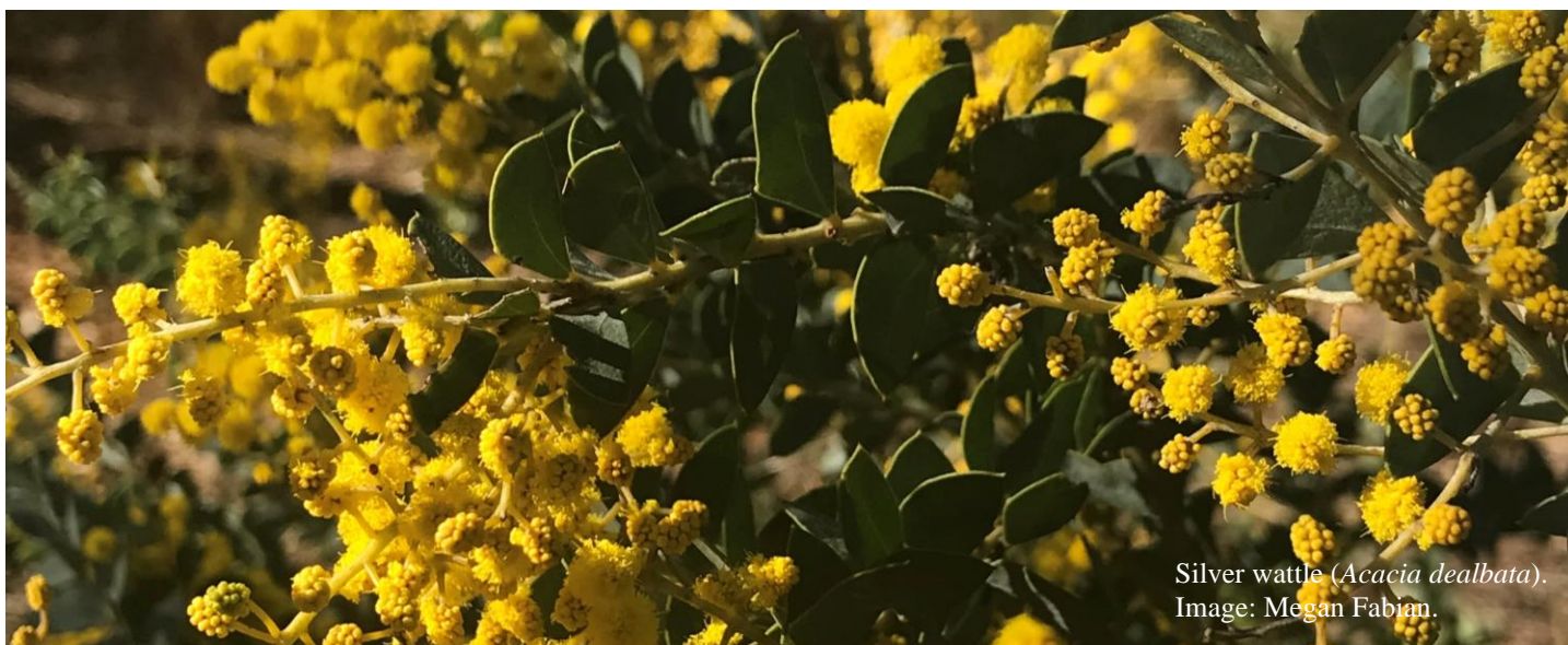
Silver wattle ( Acacia dealbata ).