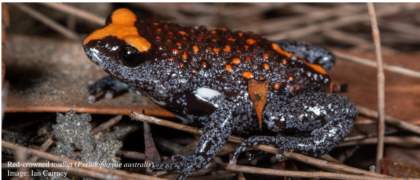
Red-crowned toadlet ( Pseudophryne australis )