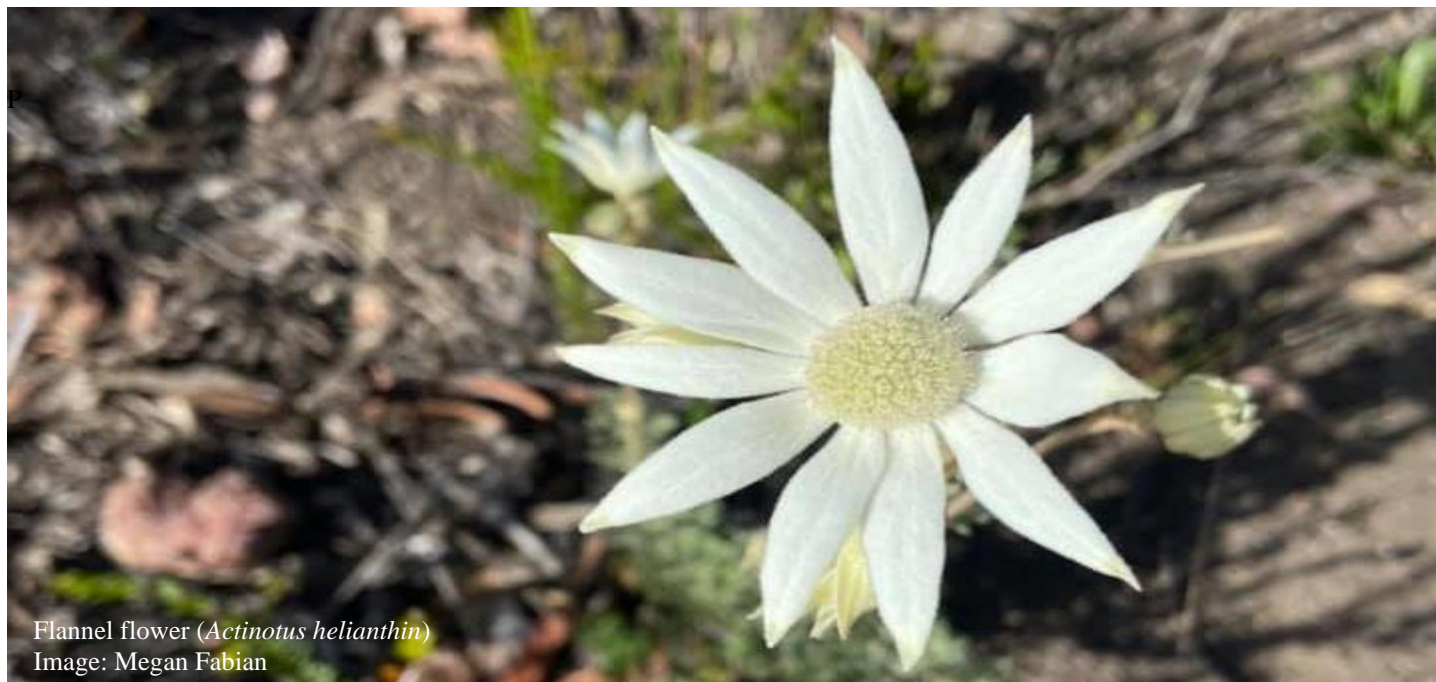
Flannel flower ( Actinotus helianthin )