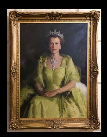
A portrait of Her Majesty The Queen on display at Government House.