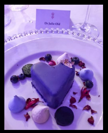
The beautiful heart-shaped jubilee dessert in royal purple – a salted caramel mousse with blueberry gel, meringue, and gold leaf.