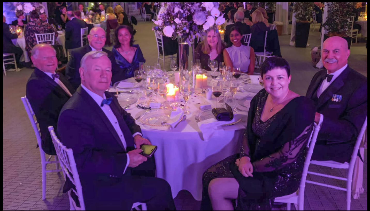
Guests on table twelve at the Platinum Jubilee Ball, Government House, Canberra.